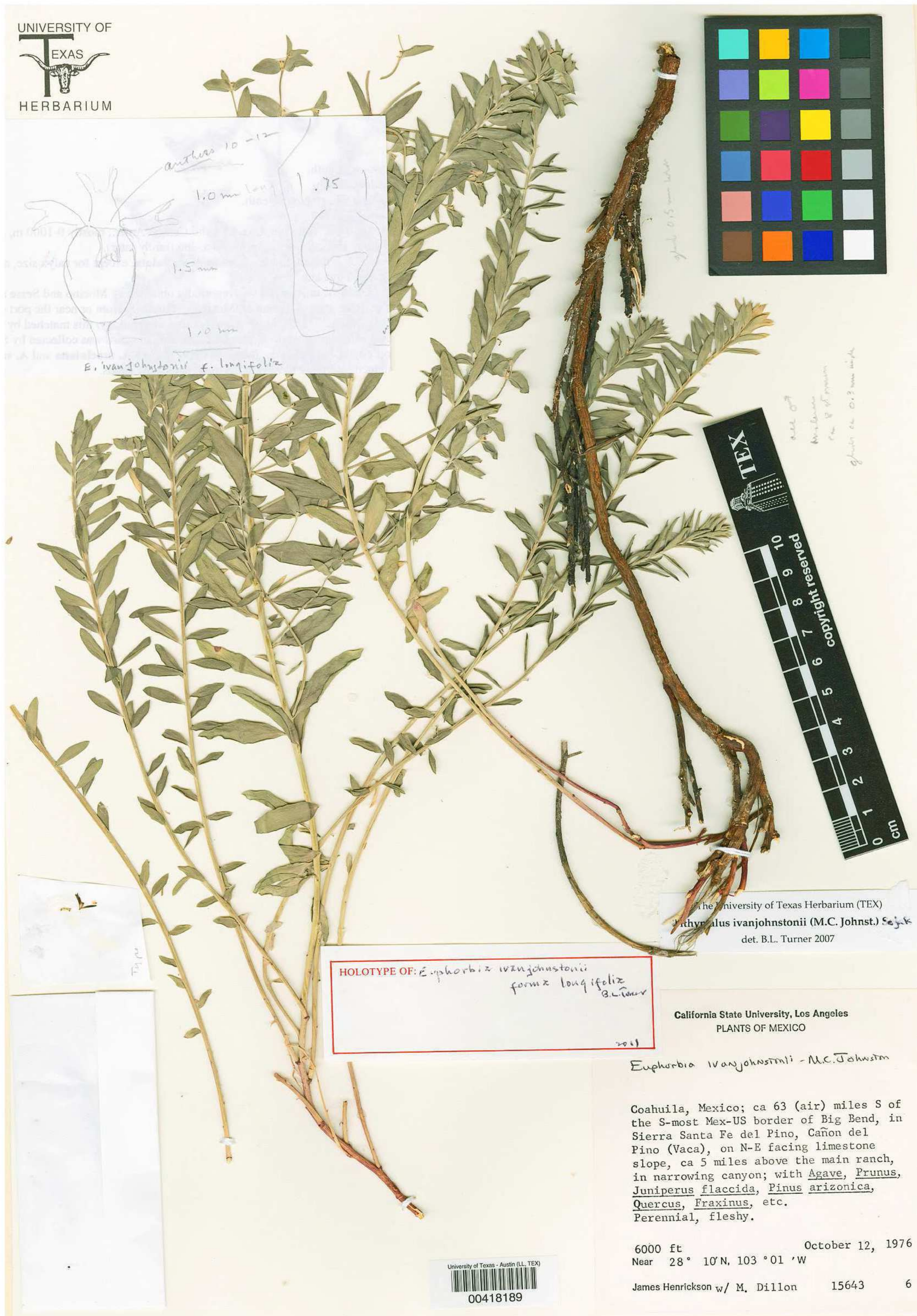
Figure 2. Euphorbia ivanjohnstonii forma longifolia (holotype: TEX).